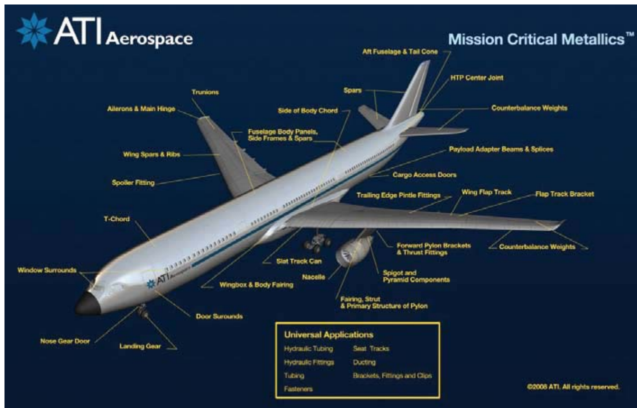
Figure 1. Titanium is used in many applications on today's commercial aircraft

ATI Aerospace has significantly expanded its product portfolio to offer airframe original equipment manufacturers (OEMs) a broad scope of titanium and titanium alloys for commercial airframe applications. ATI's products enable aerospace engineers the freedom to design and build aircraft that